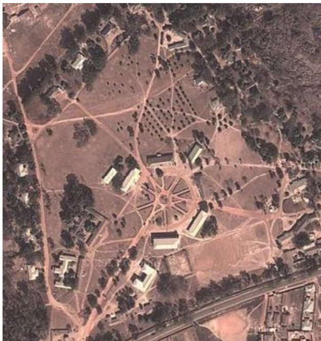
The Heart of the TCNN Campus seen from the air